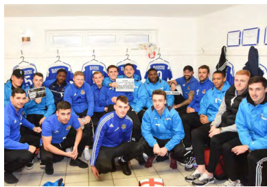
Worcester City FC