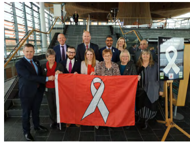
Welsh Assembly Labour Group